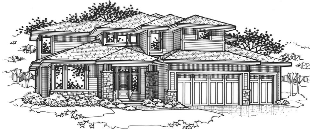
Modern Elevation (upgraded elevation shown)

1.5 Story, 4 Bedrooms, 3.5 Baths, 3370+/- square feet $445,000 + Lot