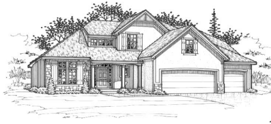
Traditional Front Porch Elevation