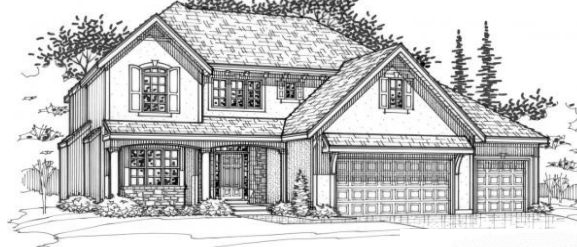
Traditional Front Porch Elevation