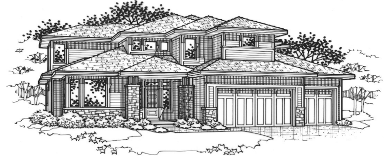
Modern Elevation (upgrades may be shown)