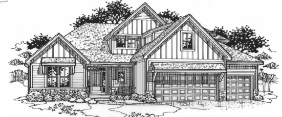
Modern Farmhouse Elevation