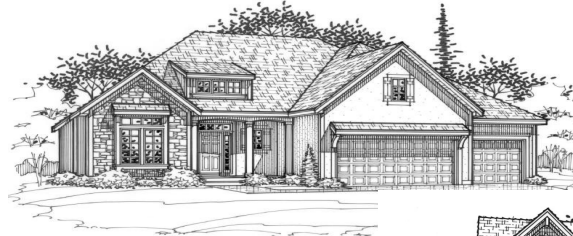
Traditional Front Porch Elevation