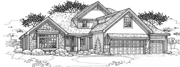
Traditional Front Porch Elevation