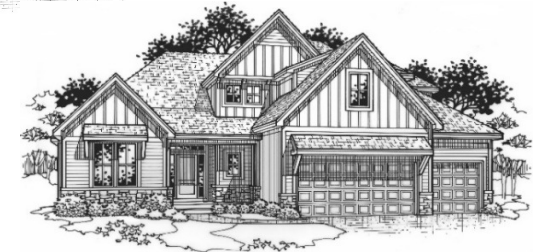
Modern Farmhouse Elevation