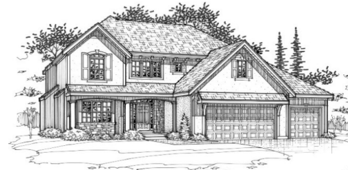
Traditional Front Porch Elevation