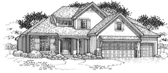
Traditional Front Porch Elevation