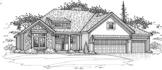
Traditional Front Porch Elevation