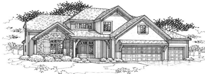
Traditional Front Porch Elevation