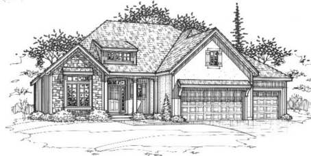
Traditional Front Porch Elevation