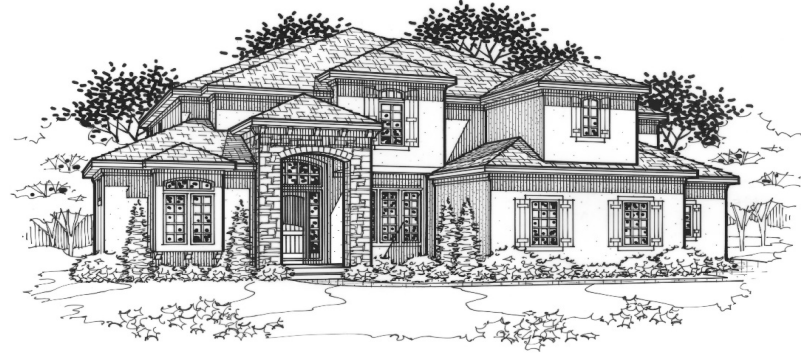
Mediterranean Elevation with OPTIONAL side entry garage