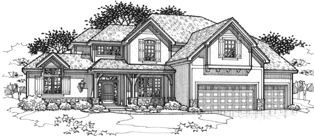
Traditional Front Porch Elevation