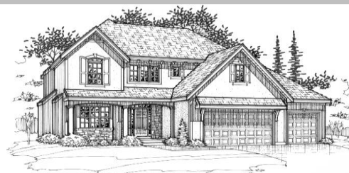
Traditional Front Porch Elevation