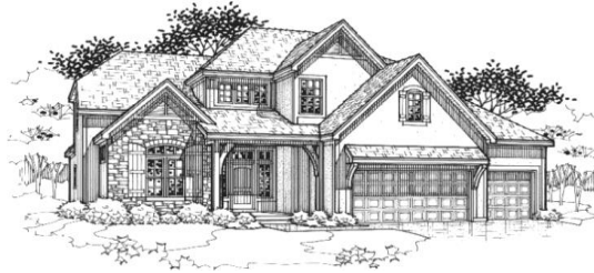
Traditional Front Porch Elevation