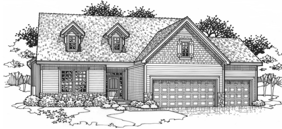
Cape Cod Elevation

1.5 Story, 4 Bedrooms, 4 Baths, 2464+/- square feet $357,000 + Lot