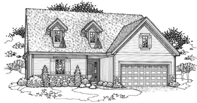
Cape Cod Elevation