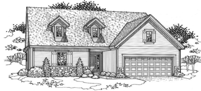
Cape Cod Elevation