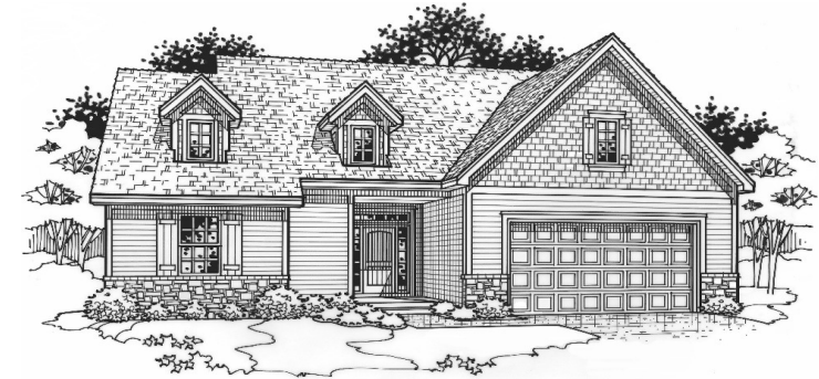
Cape Cod Elevation