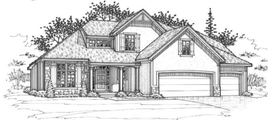
Traditional Front Porch Elevation