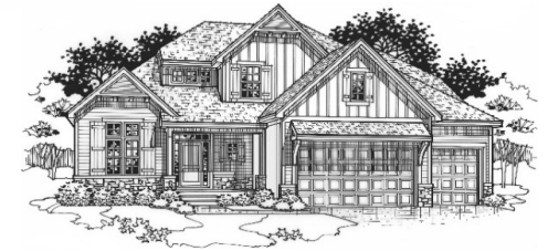
Modern Farmhouse Elevation