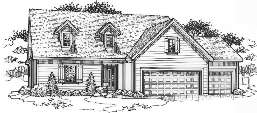
Cape Cod Elevation

1.5 Story, 4 Bedrooms, 4 Baths, 2142+/- square feet $352,000 + Lot