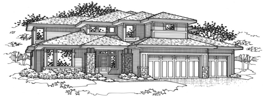
Modern Elevation (upgrades may be shown)