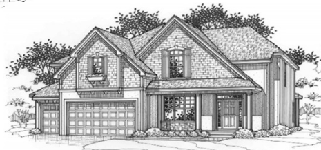
Cape Cod Elevation