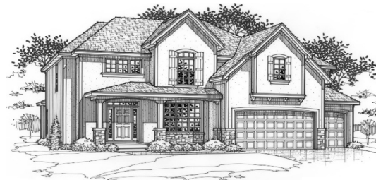
Traditional Front Porch Elevation