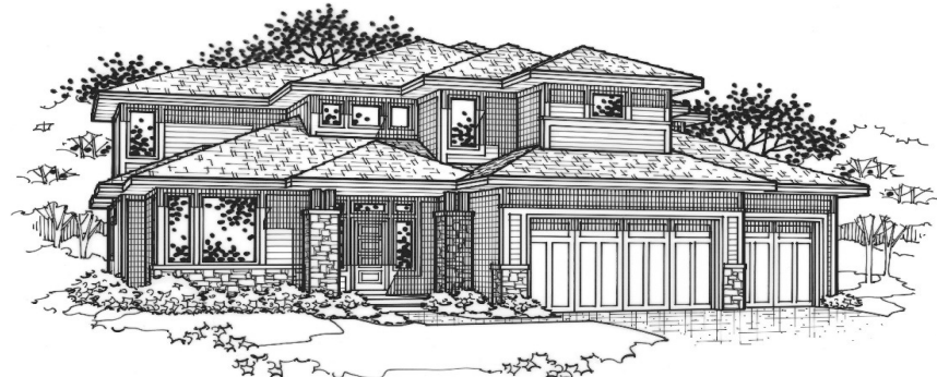
Modern Elevation (upgrades may be shown)