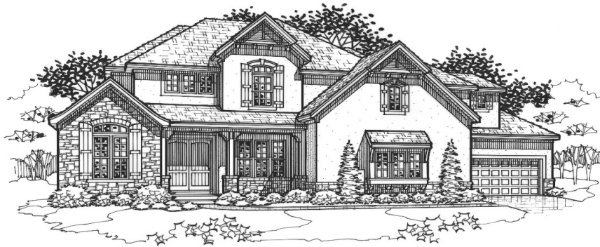
Traditional Front Porch

2 Story, 5 Bedrooms, Office, Formal Dining Room, 5 Baths, 3821+/- square feet See Website for Pricing - www.jamesengle.com/plans