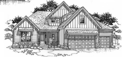
Modern Farmhouse Elevation