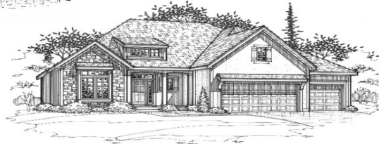
Traditional Front Porch Elevation