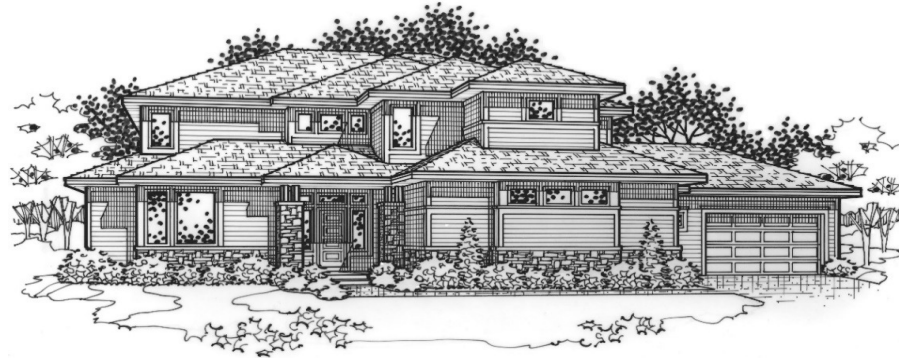
Modern Elevation (with optional 4-car side-entry garage)

1.5 Story, 5 Bedrooms, Loft, 5.5 Baths, 4225+/- square feet See Website for Pricing - www.jamesengle.com/plans