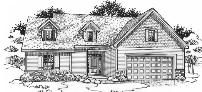
Cape Cod Elevation