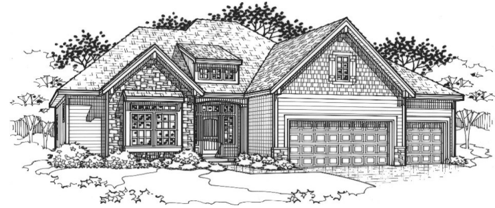
Traditional Front Porch Elevation