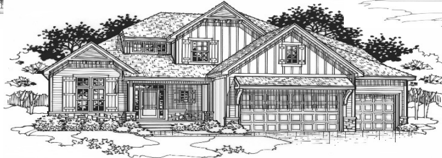
Modern Farmhouse Elevation