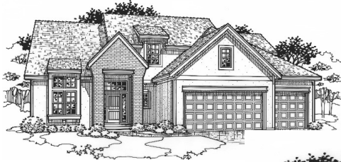
Early American Elevation

1.5 Story, 5 Bedrooms, 5 Baths, 3418+/- square feet See Website for Pricing - www.jamesengle.com/plans