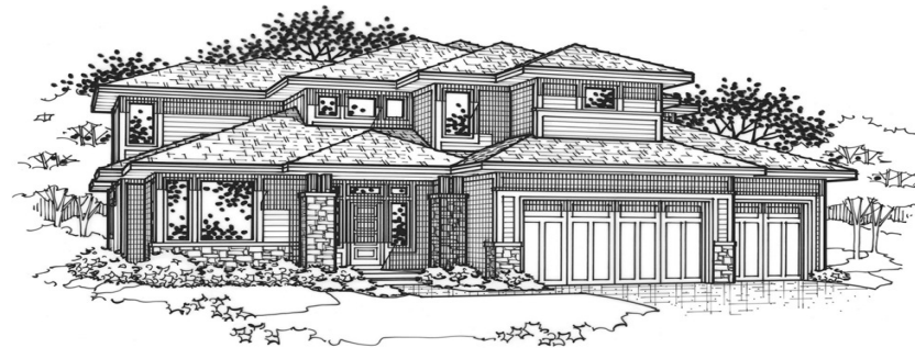
Modern Elevation (upgrades may be shown)