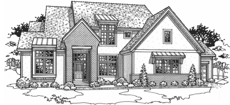
Early American (optional features shown)