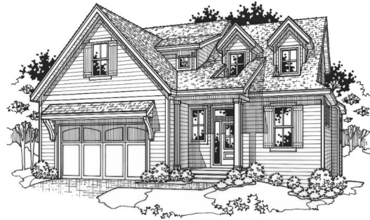
Cape Cod Elevation

See Website for Pricing - www.jamesengle.com/plans