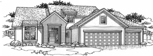
Early American Elevation