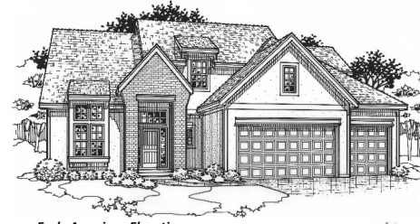
Early American Elevation