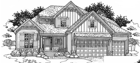
Modern Farmhouse Elevation

1.5 Story, 5 Bedrooms, Office, 5 Baths, 3711+/- square feet See Website for Pricing - www.jamesengle.com/plans