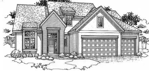
Early American Elevation