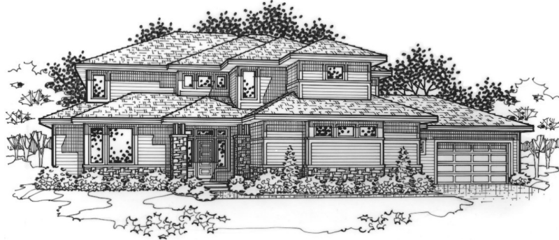
Modern Elevation (with optional 4-car side-entry garage)

See Website for Pricing - www.jamesengle.com/plans