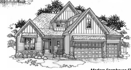
Modern Farmhouse Elevation