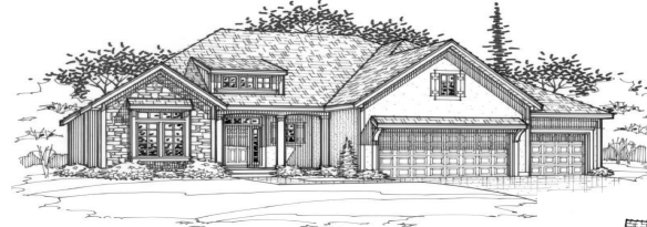
Traditional Front Porch Elevation