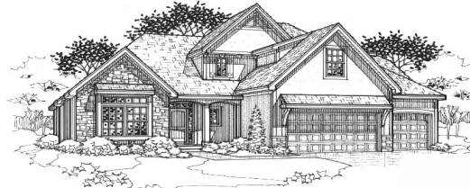
Traditional Front Porch Elevation