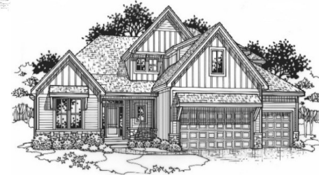
Modern Farmhouse Elevation