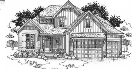
Modern Farmhouse Elevation