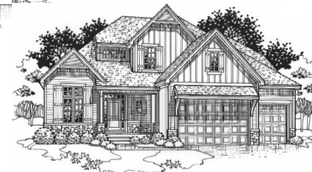
Modern Farmhouse Elevation