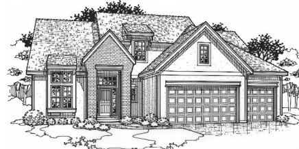
Early American Elevation